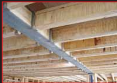
Structural dependability .. PAA certified plywood

EWPPAA has independently tested Asian structural plywood claiming to have Type 'A' bond in its composition. It was found to be something closer to non-structural Type 'D' with added dye colouring to make it look like a durable structural Type 'A' phenol formaldehyde."